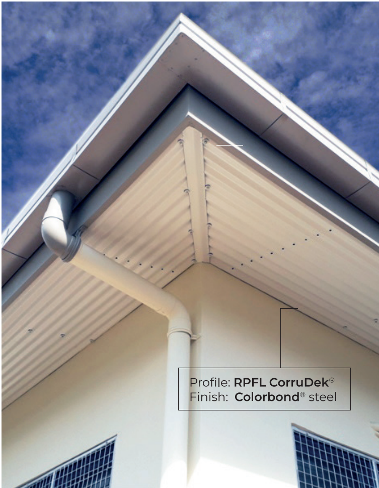
Profile: RPFL CorruDek® Finish: Colorbond® steel